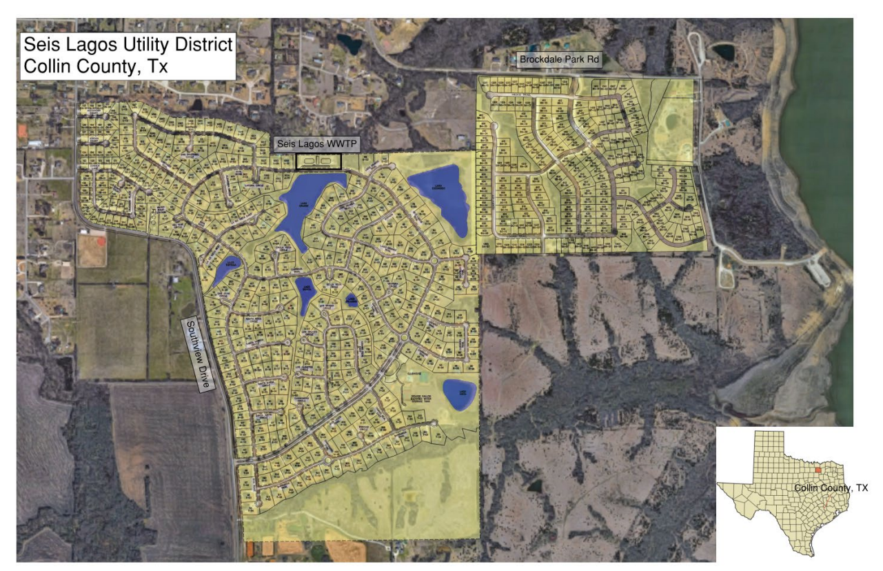
FIGURE 1 - SEIS LAGOS SERVICE AREA

The SLUD service area shown is consistent with the current CCN boundaries. Full development of the area identified as shown could lead to a total of approximately 825 sanitary sewer connections. There has not been interest in developing the currently undeveloped areas in previous years.